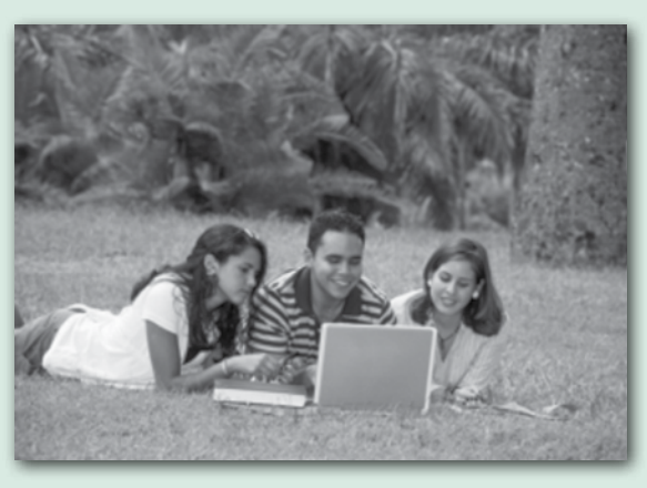
SUMMER/FALL 2012 NEWSLETTER

Thank you to all who have sent in suggestions. We have completed all the corrections and all links are fully operational. One of our new posts will be to feature new businesses that move into East Sac -so if you know of a business coming to our area let us know and we will feature them on the site. Send us your pictures: if you have a great picture of East Sac, events in East Sac or new businesses send us those photos to add to the site. We are still working on getting the PayPal set up on the site so you can pay your dues on line—this will hopefully be up soon. Please continue to send us your suggestions for the web site, news items and your comments.