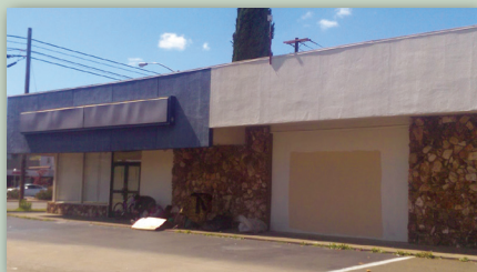
Former Kelley Moore paint store - stalled redevelopment on 66th & Folsom .