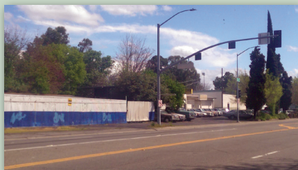
Japanese – German Auto "Boneyard" on Elvas Avenue .